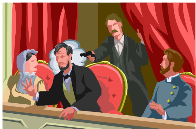
The Assassination of President Abraham Lincoln, 1865

The Vice President is first in line to take over as President. This has happened eight times in U.S. history. William Henry Harrison died in office in 1841. Zachary Taylor died in office in 1850. Abraham Lincoln was killed in office in 1865. James Garfield was killed in office in 1881. William McKinley was killed in office in 1901. Warren Harding died in office in 1923. Franklin Roosevelt died in office in 1945. John F. Kennedy was killed in office in 1963.