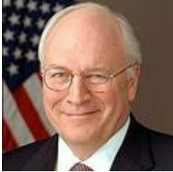
The 46 th Vice-President Dick Cheney 2001-present

Richard B. (Dick) Cheney is the 46th Vice President of the United States. Vice President Cheney grew up in Wyoming. He later represented the people of Wyoming in the U.S. Congress. As Vice President, Cheney is President of the U.S. Senate and a top advisor to the President.